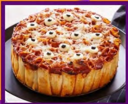
CREEPY PEEPERS PASTA