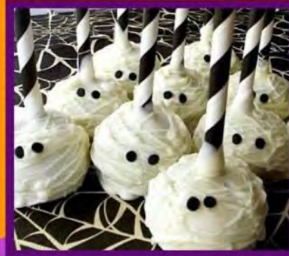
MUMMY OREO BALLS

STUDENTS SHOULD WEAR COMFORTABLE CLOTHING. LONG HAIR SHOULD BE TIED BACK. NO OPEN-TOED SHOES & BRING A WATER BOTTLE.